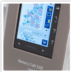
FULL COLOR LCD TOUCHSCREEN