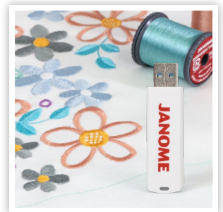
USB WITH 30 EXCLUSIVE DESIGNS